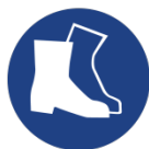
Closed in Footwear